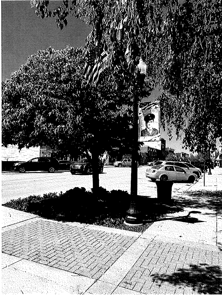
Example of current Hometown hero banner placement in the Imlay City Streetscape